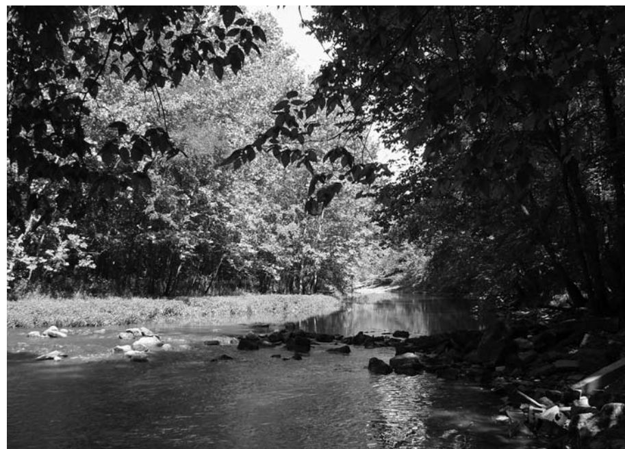
View of Caesar Creek from the small spur trail

Take 21 steps down to the platform and look to the left at the gorge area. After 12 more steps, the trail becomes a mulched path. At 0.74 miles, you'll encounter another series of steep steps and a boardwalk. The gorge and stream are to the left.